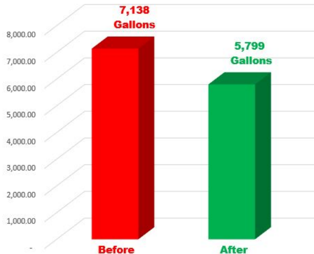
Average Monthly Consumption Rate Before and After Installation