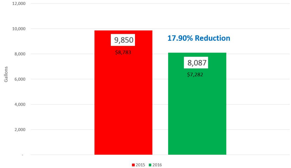
Average Daily Gallons (month vs month)

Since installing (1) 1" Flow Management Device with Zennergy LLC, on 3/20/16 the property has realized an 17.9% decrease in average daily water consumption when comparing August and Sept. of 2015 to the same months of 2016. The post installation water consumption from March through July has been excluded due to a leak that was discovered.